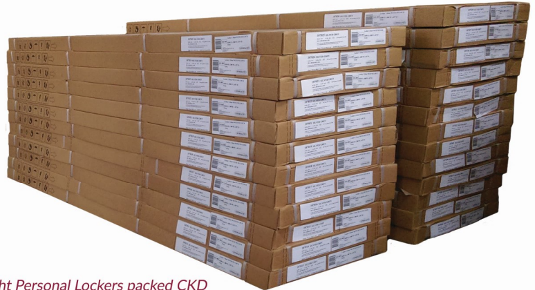
Stack of Full Height Personal Lockers packed CKD

The flat pack product provides a winning combination to our Channel Partners and final customers. The flat pack reach our Partners safely at a lower cost wherever they are located across the globe. It takes up very little storage space besides ensuring quick assembly.