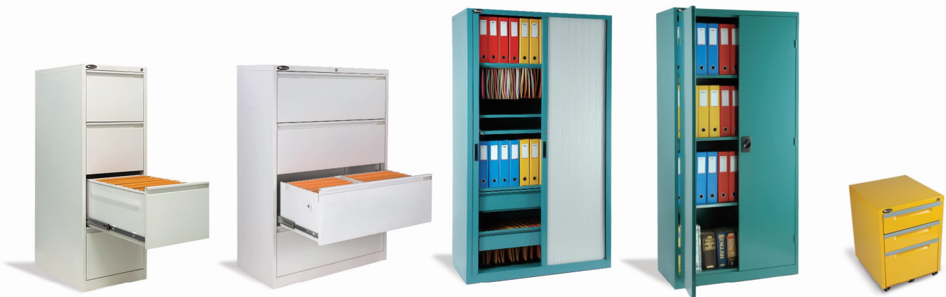
Vertical Filing Cabinet