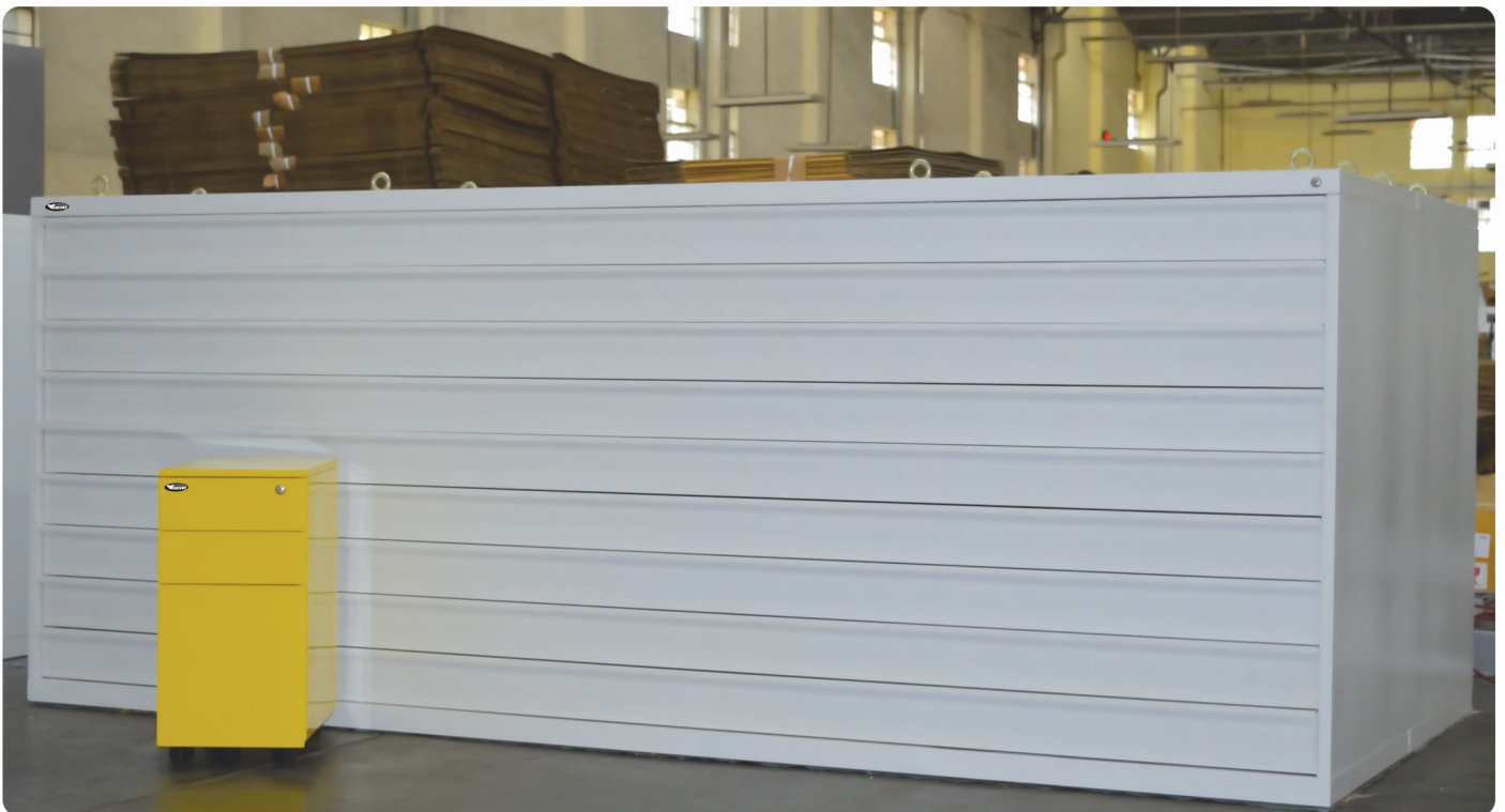
Pedestal: H 635mm X W 300mm X D 515mm; Costume Storage Cabinet: H 1200mm X W 3115mm X D 1500mm

The flat pack product provides a winning combination to our Channel Partners and final customers. The flat pack reach our Partners safely at a lower cost wherever they are located across the globe. It takes up very little storage space besides ensuring quick assembly.